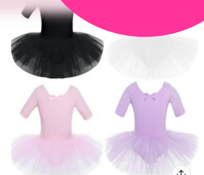
Tutu with Delicate Bow $22.00