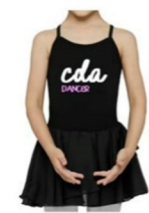
CDA Custom Leotard with Attached Skirt