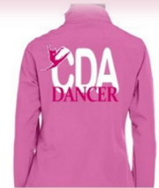
Pink Zip Up CDA Warmup Jacket $29.00