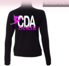
Black Zip Up CDA Warmup Jacket $29.00