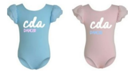
Pink or Blue Ruffle Sleeve Leotard $16.00