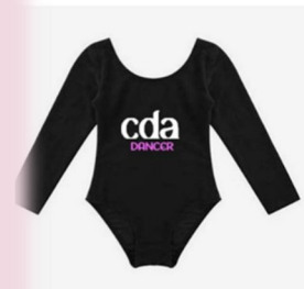
Custom Black Longsleeve Leotard $18.00